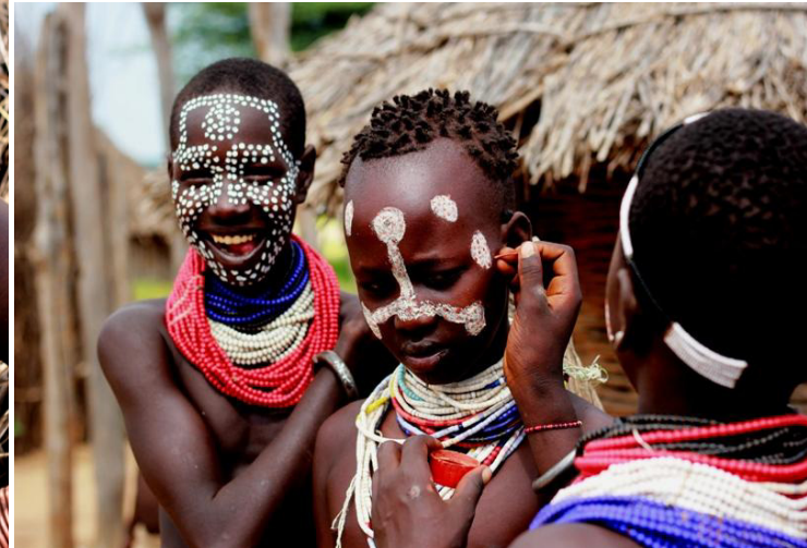
Interesting painting ethnic at South Ethiopia

Day 15 (12 Nov) Turmi (Turmi - Karo- Turmi 130KM) : In the morning visit small ethnic group of diamonds on the Omo River called Karo. Particularly impressive from Konso are their body paintings and decorations scars. The Karo Tribe is the smallest tribe in the Omo Valley, South Ethiopia, and resides along the banks of the