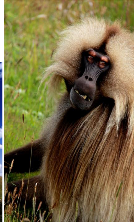
Simien National Park//Gelada Baboon

Day 6 (3 Nov) Debark -Axum (260 KM) : Leave Debark and drive parallel to spectacular switchbacks to the Semien Mountains towards Axum. Green plateaus, steep cliffs and steep slopes characterize this impressive mountain scenery. On a clear day you can even see the highest mountain in Ethiopia, the Ras Dashen (4550 m). Many endemic species like Rotbrustpavian, Ethiopian wolf and Ethiopian ibex live in Semien National Park (UNESCO World Heritage). Today journey estimate take 6 to 8 hours and expected arrive evening in Axum.O/N Axum